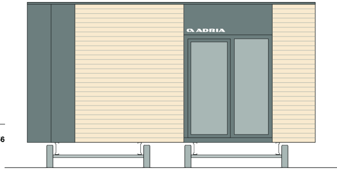
Aurora Twin 856